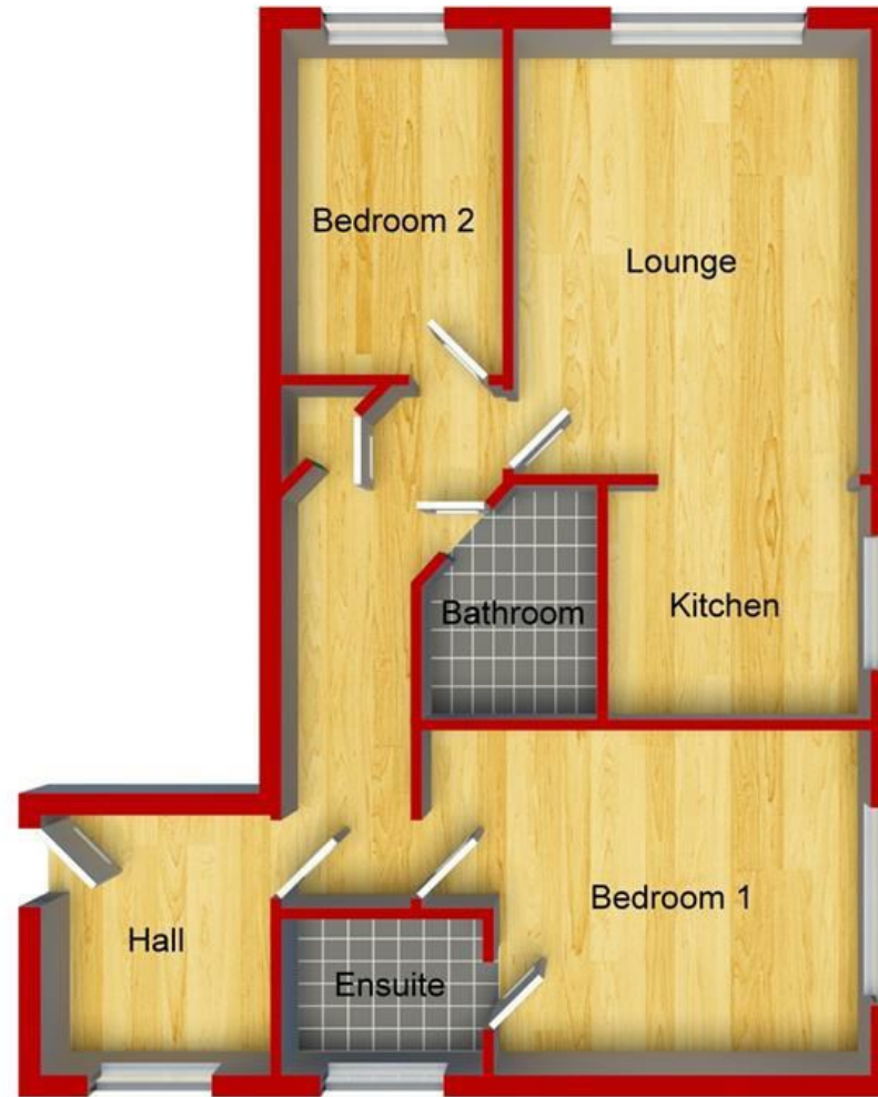
4 Swan House